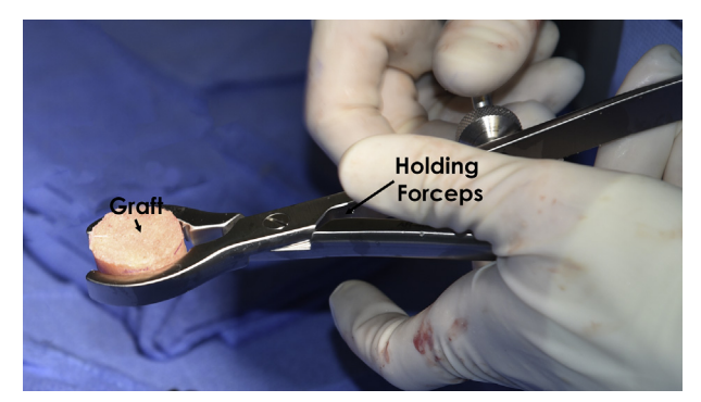
Fig 7. Holding forceps are used to grasp the graft while the graft is trimmed to fit the exact depth dimensions of the patient's now-reamed chondral defect. Care should be taken to ensure the measurements are correct before this step.

is harvested from the allograft with a coring reamer while a copious amount of irrigation is used to prevent heat necrosis. The subchondral bone of the donor plug is then trimmed according to previous measurements to match the corresponding depths of the host location with the use of holding forceps, and the surfaces are smoothed with a rasp (Fig 7). The depth of the recipient site and donor plug is measured several times to make sure there are no areas that will be too prominent.