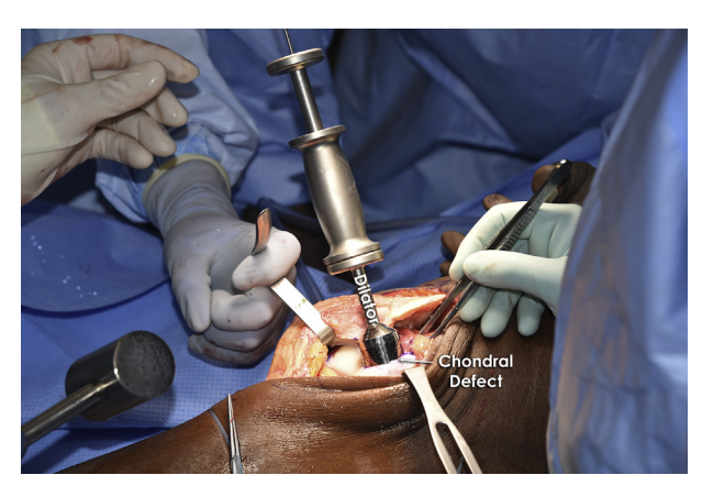
Fig 6. A dilator is used on the trochlear defect in the left knee repeatedly to facilitate implantation of the donor osteochondral allograft.

Next, the corresponding area on the allograft is outlined, by use of the sizer that had previously been used to measure the trochlear defect, with methylene blue to match the dimensions of the patient's knee defect. Of note, the area to be replaced should match the area of the donor site. The donor condyle is then secured within an allograft workstation (Arthrex) to ensure precision during harvest. The osteochondral donor plug