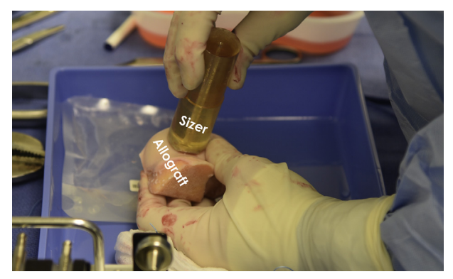
Fig 4. The same sizer that was used to measure the size of the trochlear defect is used on the allograft to ensure the graft is large enough.

The edges of the defect are scored with the recipient harvester. The defect is then reamed until bleeding healthy bone is encountered (Fig 5), with care taken not to exceed a maximum of 7 to 8 mm of overall depth. This can be achieved by frequently checking the calibrated coring reamer (Arthrex, Naples, FL), along