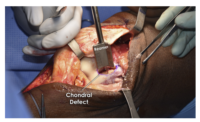
Fig 5. A guide pin is placed in the left knee through the center of the sizer, and the sizer is removed and replaced by a reamer. The chondral defect is reamed to the depth at which bleeding healthy subchondral bone is encountered. During reaming, the area should be copiously irrigated to ensure overheating does not occur.

with a final measurement. During reaming, a copious amount of irrigation fluid at room temperature is used to avoid heat necrosis of the surrounding articular cartilage and subchondral bone. The recipient site is then dilated with a smooth cylinder (Arthrex) (Fig 6) several times to ensure the donor plug can be inserted without the need to apply too much pressure. To accomplish a perfect fit between the donor graft and the host socket, a compass reference is created on the prepared defect and measures are taken from each main coordinate (north, south, east, and west). These measurements will be used later, at the time of graft trimming.