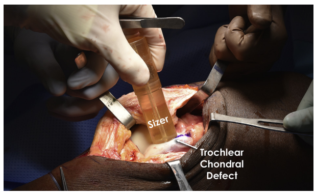
Fig 3. Once the defect has been properly exposed, identified, and marked with a surgical pen in the left knee, a cannulated sizer is used to ensure proper sizing of the osteochondral allograft.