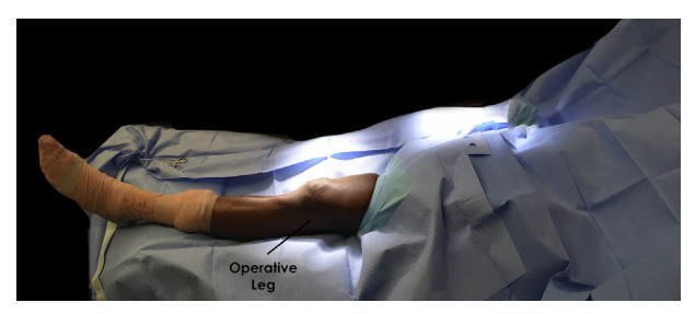
Fig 1. Patient positioning. The operative (left) leg is prepared and draped in sterile fashion. Coban (3M Company) is wrapped around the calf and extended distally around the patient's left foot. The surgeon should ensure that sufficient work space is exposed around the patient's knee.

results. 10,11 Advantages compared with techniques include the following: It is a 1-stage procedure, there is no donor-site comorbidity, the graft is designed according to the shape of the defect with a similar load area between the donor and the host, and the procedure can be combined with additional procedures. The main disadvantages are the risk of immunologic reactions and disease transmission. The purpose of this Technical Note is to describe a reproducible surgical technique for addressing large chondral defects of the trochlea that allows for preservation of most of the patient's native cartilage and bone and allows for a quicker recovery than some regeneration techniques.