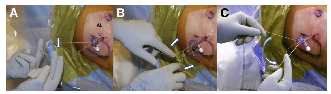
Fig 3. Intraoperative images of a right hip with a cannula placed into the anterolateral portal (AL) with sutures within the cannula. The sutures have been previously passed through the proximal and distal limbs of the capsulotomy. (A) Two fingers from each hand are placed within the looped end of the No. 2 vicryl (arrow), (B) each hand is then pronated to form 2 separate loops (arrows), and (C) both loops are placed around the fingers of one hand, while 1 free end of the suture is then passed through both loops (arrow). The 2 free ends are then pulled to tighten the Quebec City Slider knot and secured with alternating half-hitch knots.

After routine preparation and draping of the affected hip, the arthroscopic procedure is performed with the patient in the supine position (Video 1). Anterolateral and midanterior portals are established to allow access to the central compartment (Fig 1). A diagnostic arthroscopy is performed using a 70° arthroscope to evaluate for intra-articular pathology. An interportal capsulotomy is performed with a beaver blade (Arthrex, Naples, FL) approximately 1 cm distal to the labrum. The capsule is incised parallel to the acetabular rim from the 12 o'clock to 3 o'clock position, connecting the midanterior and anterolateral portals. All