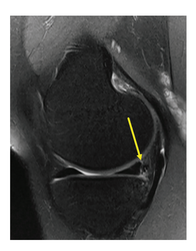
Figure 2. Sagittal T2 magnetic resonance image of the medial compartment of a right knee demonstrating subtle separation in the posteromedial meniscocapsular junction consistent with a ramp lesion (yellow arrow).

While MRI is a reliable diagnostic modality for most meniscal pathologies, studies have reported low sensitivity of MRI to detect ramp lesions. Edgar et al 13 reported detection of ramp lesions in 33 of 43 patients using MRI, resulting in a sensitivity of 77%. However, a prospective case series by Bollen reported 0 of 11 arthroscopically confirmed ramp lesions were detected on MRI. Bollen theorized that MRI identification of ramp lesions was limited due to the knee being in near full extension at the moment of the study, which reduces the meniscocapsular separation. This is similar to how a reduced bucket-handle tear may not be detected on MRI. In accordance with Bollen Liu et al 26 concluded that preoperative confirmation of a ramp lesion was difficult, and MRI patient data did not correlate with the diagnosis of a ramp lesion.