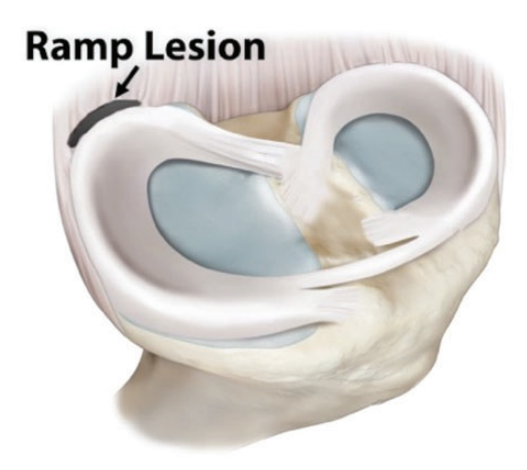
Figure 1. Schematic diagram of a left knee (disarticulated from the femur) demonstrating the location of a ramp lesion in the posteromedial meniscocapsular junction of the medial meniscus.