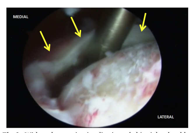
Fig 1. With arthroscopic visualization of this right shoulder joint using a 30° arthroscope through the posterior portal, the rotator cuff tendon (yellow arrows) can be visualized medially to its anatomical insertion on the greater tuberosity. Following the release of the rotator cuff from all adhesions, the mobility of the tendon is evaluated.

cuff muscle atrophy were seen in these patients. Of these 23 patients, 20 (83.3%) showed no tendon retear at follow-up on magnetic resonance imaging.<sup>7</sup>