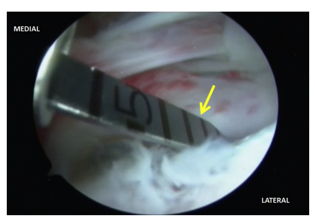
Fig 3. Once the 2 anchors are inserted on the superior aspect of the glenoid and the correct position is confirmed using a 30° arthroscope through the posterior portal, a sizing device (yellow arrow) is used to measure the correct size for the graft to be inserted in the right shoulder through use of anterior to posterior and medial to lateral measurements.

using 2 4.75-mm SwiveLock anchors (Arthrex) and FiberTape suture (Arthrex). To place the SwiveLock anchor (Arthrex), a 4.0-mm drill (Arthrex) is used to make a tunnel where the anchors will be placed. If the bone quality is good, it may be necessary to use a tap before inserting the Swivelock (Arthrex). The FiberTape suture (Arthrex) is passed through the dermal patch and then through the SwiveLock, and a horizontal stitch is tied.