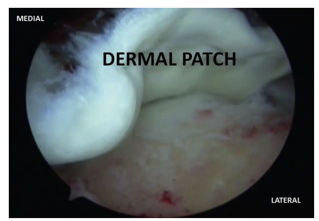
Fig 4. Using the sutures previously retrieved from the right shoulder while visualizing the joint through use of the arthroscope in the posterior portal, the dermal patch that was previously prepared in the back table using the intra-articular measurements is brought to the superior aspect of the glenoid in this right shoulder using a tension slide technique.

The greater tuberosity is then prepared anteriorly, middle, and posteriorly, using a burr and a radio-frequency burr (Fig 5). The rotator cuff is mobilized and pulled laterally. To ensure a complete mobilization of the rotator cuff, anterior and posterior releases of all the