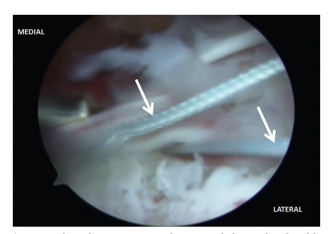
Fig 2. With arthroscopic visualization of this right shoulder through the posterior portal, the superior aspect of the glenoid is prepared using a combination of a radiofrequency wand and high-speed osseous burr. Following this, 2 3.0-mm SutureTak anchors (white arrows) are used, one placed at the 10 o'clock and the other at the 2 o'clock position using the Neviaser portal. Following this, the sutures are retrieved.

In preparation of additional anchors to be inserted, the superior glenoid is then prepared with an arthroscopic burr (Smith and Nephew) to get a bleeding surface. The capsule is repaired to the most medial aspect of the joint