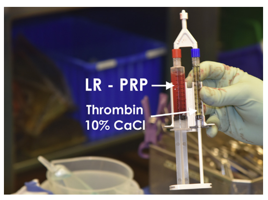
Fig. 2. A double syringe system for injection (11:1 ratio allowing homologous mixture of the PRP [ left ] and a gelling agent solution [ right ], respectively). Gelling agent solution typically consists of thrombin and 10% calcium chloride (CaCl) solution (1000 IUs thrombin:1 mL CaCl). LR, leukocyte rich.

strength, gene activation, trophic induction, and microenvironment facilitation and signaling with cells or bioactive factors to optimize, delay, or prevent premature progression of osteoarthritis. ^{18} It is accepted that the success of an ACL reconstruction depends heavily on biological processes for each phase of the healing process. Commonly reported regenerative modalities contain various GFs, including transforming GF \beta -1 (TGF- \beta 1), fibroblast GF-2 (FGF-2), insulinlike GF, epidermal GF, platelet-derived GF (PDGF), and vascular endothelial GF (VEGF). These GFs have demonstrated positive effects on cell proliferation, cell migration, angiogenesis, and extracellular matrix (ECM) production in numerous cell types of both in vivo and in vitro models. ^{19}