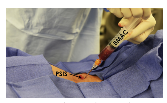
Fig. 3. A patient in ventral decubitus for BMAC from the left posterior superior iliac spine (PSIS).

The primary cell in the ACL is the fibroblast. The fibroblast has receptors for many of these GFs, including PDGF, TGF- \beta , and FGF. For example, PDGF stimulates fibroblast growth, migration, and biosynthetic activity, ^{20} which could promote an improved ligamentization of the graft used for ACL repair or reconstruction and minimize the proinflammatory factors released immediately after surgery but might also contribute to a better and faster integration of the graft within the femoral and tibial tunnels, thus, avoiding an increased failure risk. ^{21}