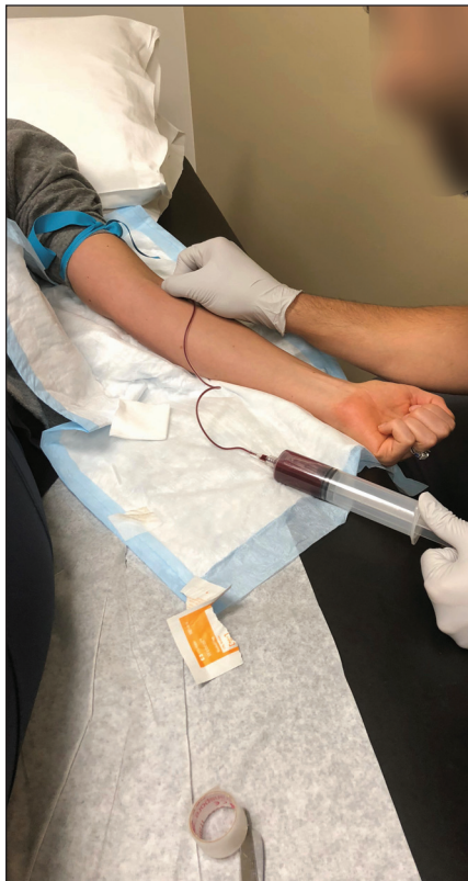
Figure 1: Clinical photograph showing a standard venipuncture for collecting whole blood used in platelet-rich plasma.